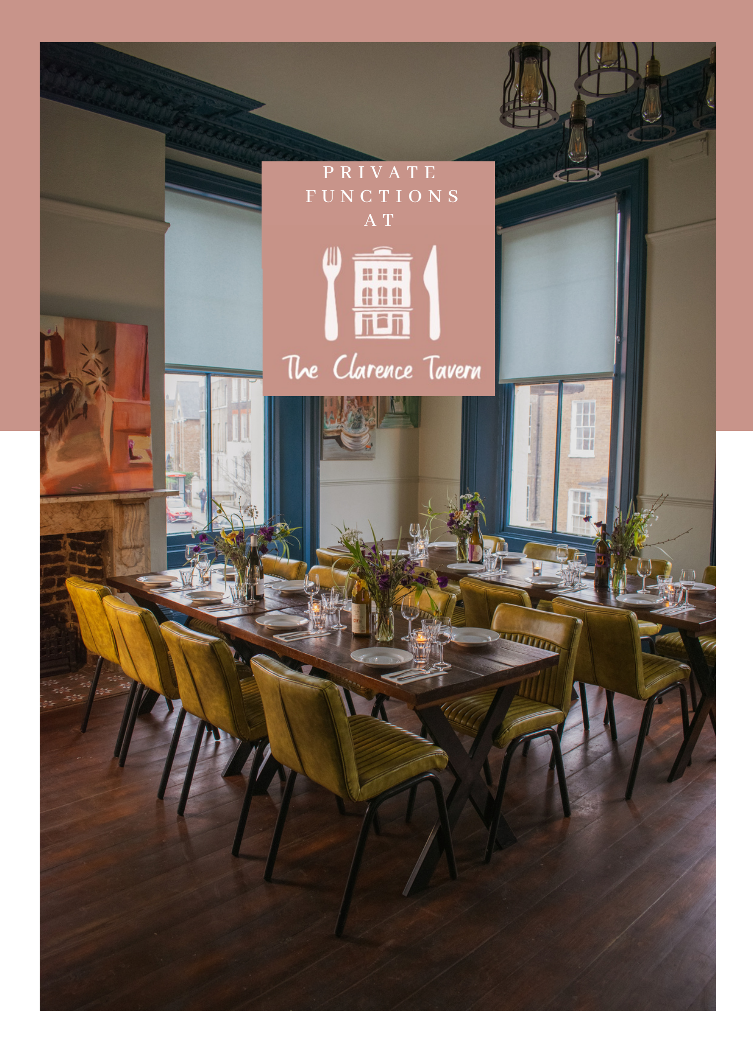
\mathbf{W} \ \mathbf{W} \ \mathbf{W} \ . \ \mathbf{C} \ \mathbf{L} \ \mathbf{A} \ \mathbf{R} \ \mathbf{E} \ \mathbf{N} \ \mathbf{C} \ \mathbf{E} \ \mathbf{T} \ \mathbf{A} \ \mathbf{V} \ \mathbf{E} \ \mathbf{R} \ \mathbf{N} \ . \ \mathbf{C} \ \mathbf{O} \ \mathbf{M}